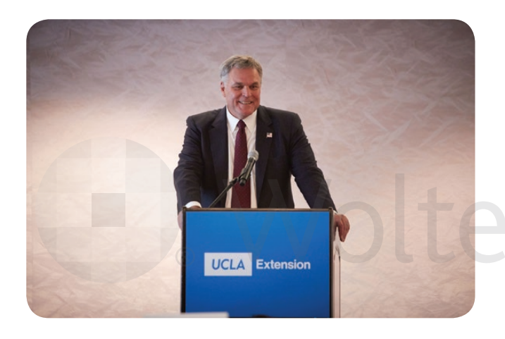
IRS Commissioner Charles Rettig